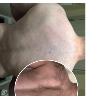
Before and after - client of Halo, May 2016 - June 2017, Eight full back sessions.